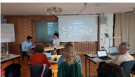
Junior Researcher Workshop.

As an extended outcome of the workshop, a symposium abstract was put together by some of the junior researchers and submitted for the Nordic Congress of Gerontology.