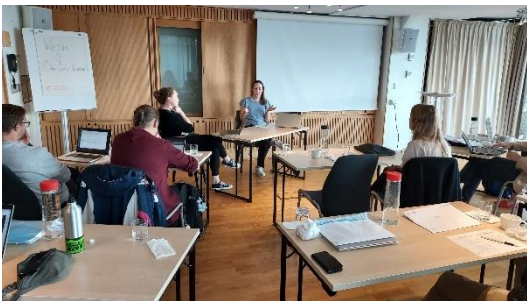
Junior Researcher Workshop.

In September 2023, ten junior researchers in the SIA network gathered in Stockholm/Lidingö, Sweden, for two days of networking and research presentations. Presentations and discussions offered various perspectives on inequalities and aging, for example intergenerational transfers, mental and cognitive health, health care utilization, social relationships, and selective mortality, to name some.