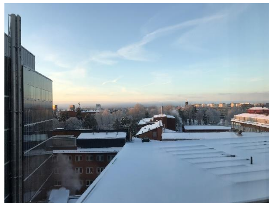
View from ARC, Karolinska institutet.

NordForsk, who supported our main SIA project, has made a pre-announcement for a call on migration and integration.