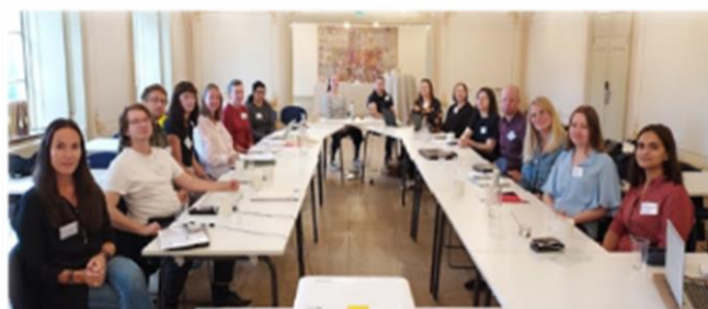
Pic: Junior Researcher workshop