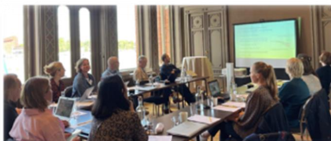
Pic: Senior Researcher workshop